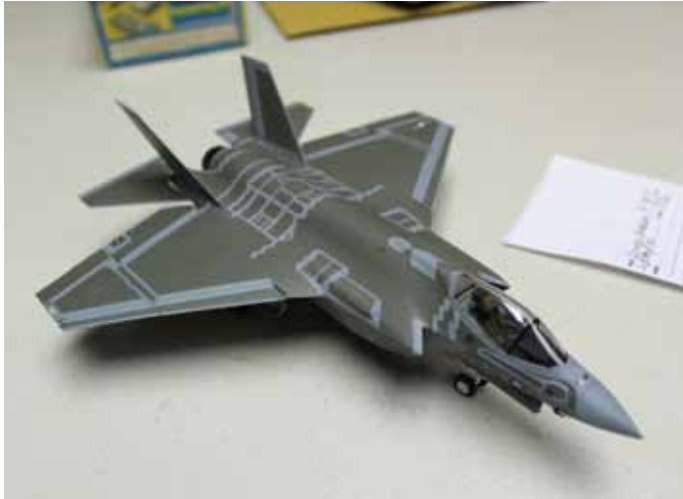
F-35C, 1/72, by Howard Rifkin.