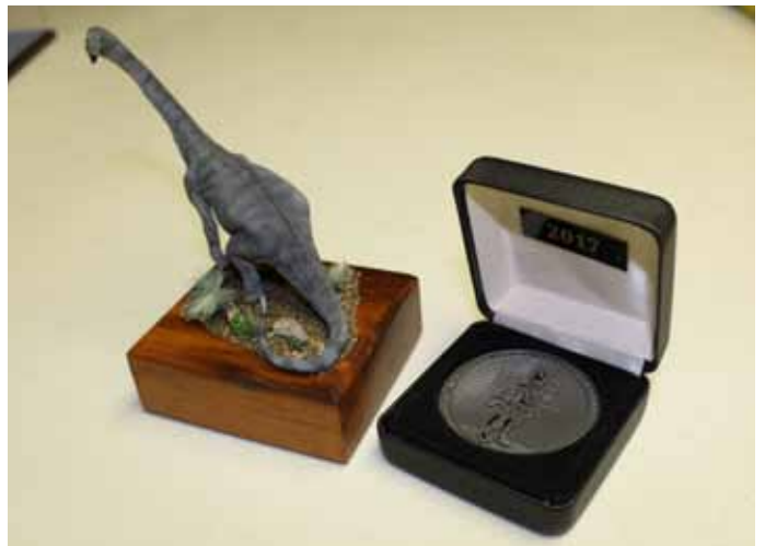
Andesaurus