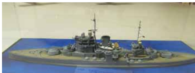
HMS Valiant