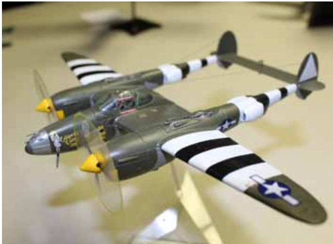
Day-at-the-Beach theme entry: P-38L Lightning, 1/72, by Mike Turco.