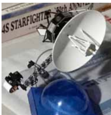
Voyager by Mike Turco

Five DVSMers entered models and had a very good day, all five coming home with something to show for their efforts, winners amid the excellent competition that's always on display at MosquitoCon. Congratulations! ■