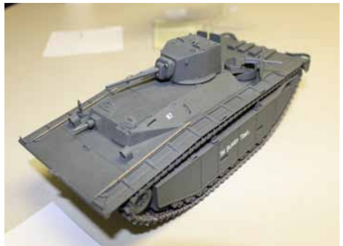
Day-at-the-Beach theme entry: LVT, 1/72, by Howard Rifkin.