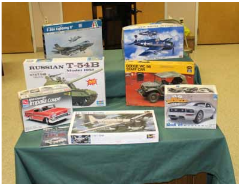
Goodies on offer for the May 2017 DVSM Meeting raffle.