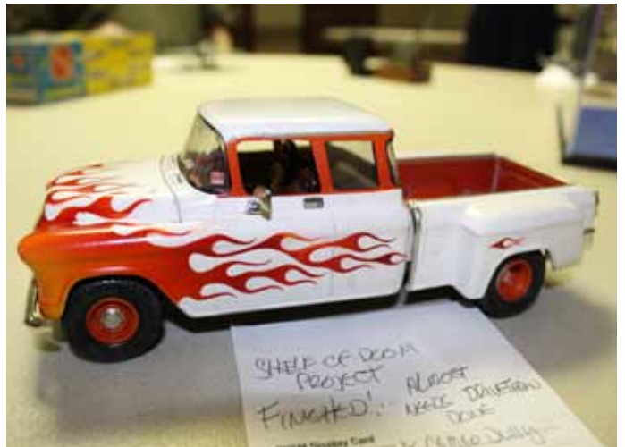
1955 Chevy Cameo custom pickup, 1/25, by Rod Rakos.