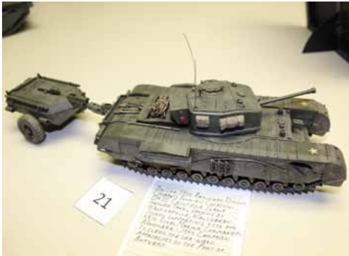
Day-at-the-Beach theme entry: Churchill Crocodile, 1/35, by Lance Lacey.