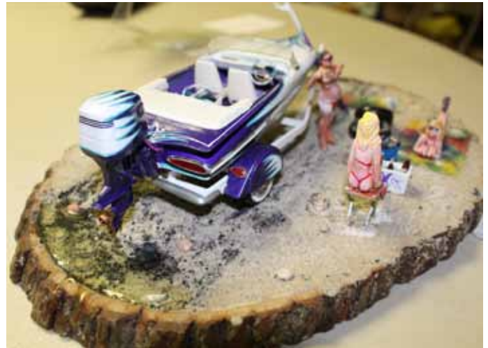
Day-at-the-Beach theme entry: '59 Impala speedboat, 1/25, by Rod Rakos.