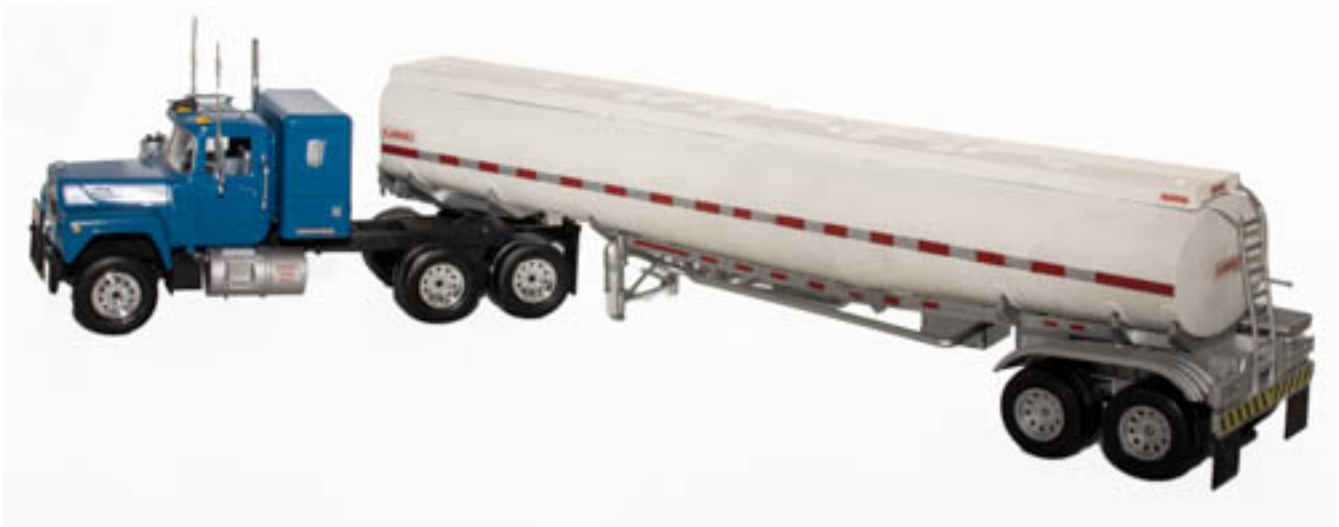
Roger Gutierrez's Tank Truck

Roger Guterriez brought a 1/24 th /1/25 th tank truck.