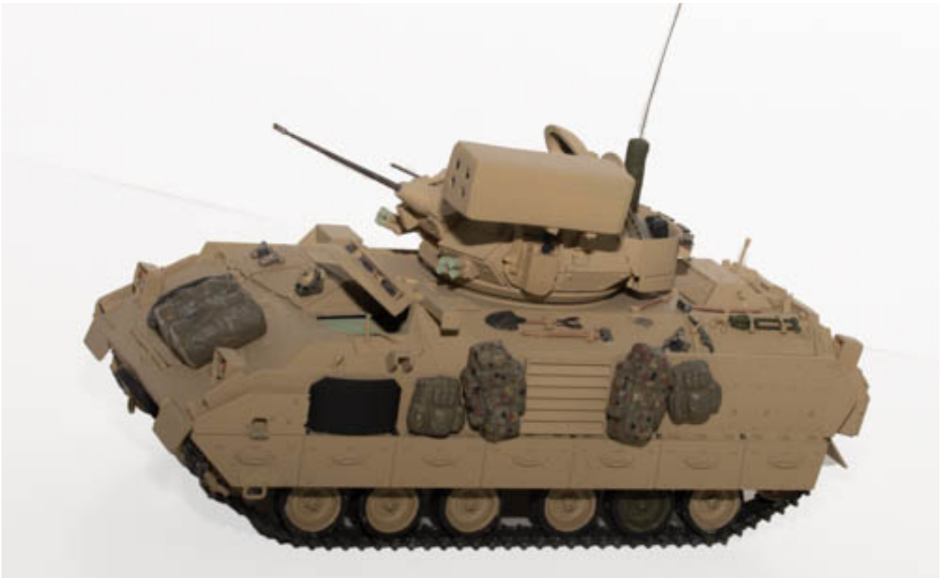
Carl Webster's Line Backer Bradley