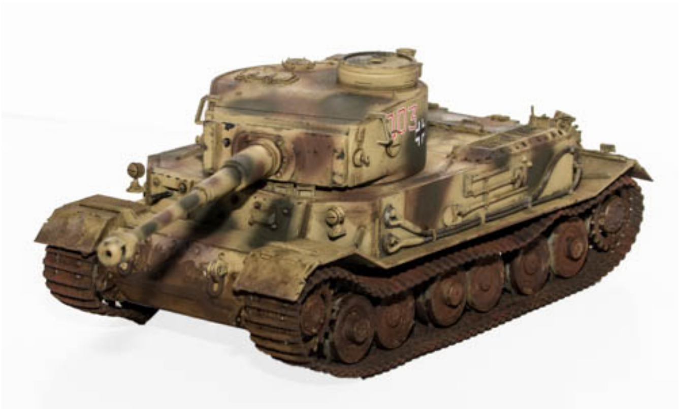
Sal Samenio's Tiger 1