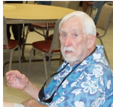
John Paul Jones