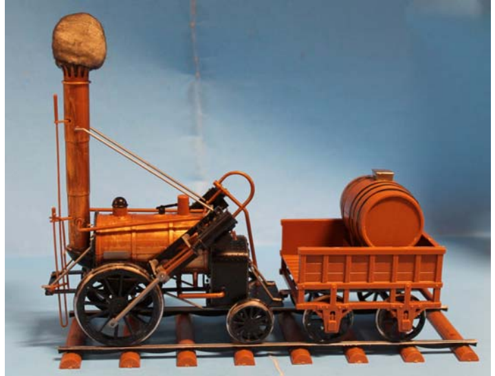
Chuck Converse built this 1/26 th AHM "Rocket" early locomotive