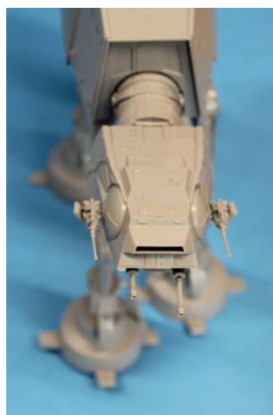
Icie Cook's latest "work in progress" is this nice 1/144 th Bandai Star Wars AT-AT