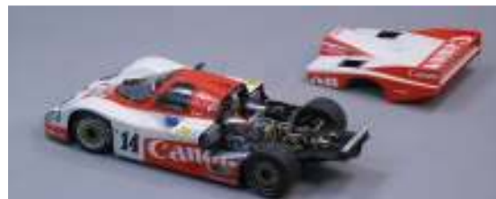
Here are photos of the built up kit off the internet (not Elliott's). Photos of the real thing are on the back page.

If you take your time, and pay attention to how things fit you should have little trouble in assembling this Skill Level 3 excellent Porsche kit – one of Tamiya's BEST. Grab one, and have fun with it. ED