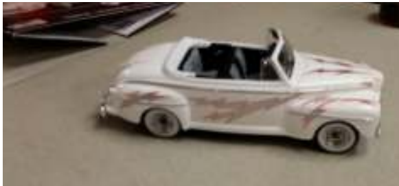
Ed Sexton with Grease 50 th anniversary of the movie 48 Ford