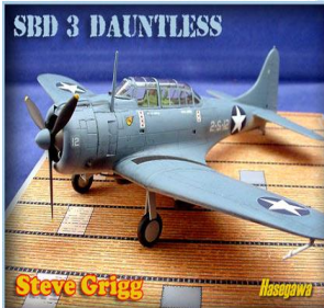
SBD 3 DAUNTLESS