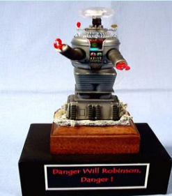
Danger Will Robinson Danger I