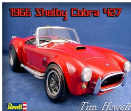
1966 Shelby Cobra 427