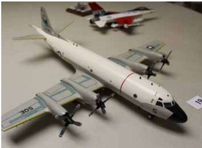
P-3 Orion, 1/72, by Glenn Hoover