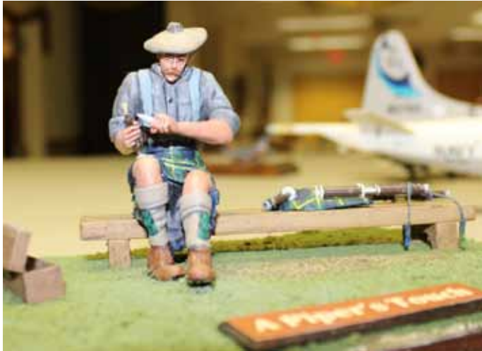
“The Piper’s Touch” by Joe Vattilana