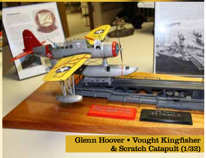
Glenn Hoover • Vought Kingfisher & Scratch Catapult (1/32)