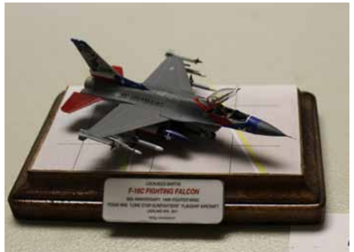
F-16C Fighting Falcon, 1/144, by Mike Turco