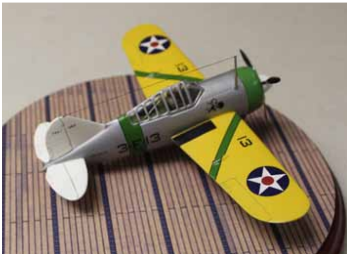
Brewster F-2A Buffalo, 1/72, by Paul Tomczak