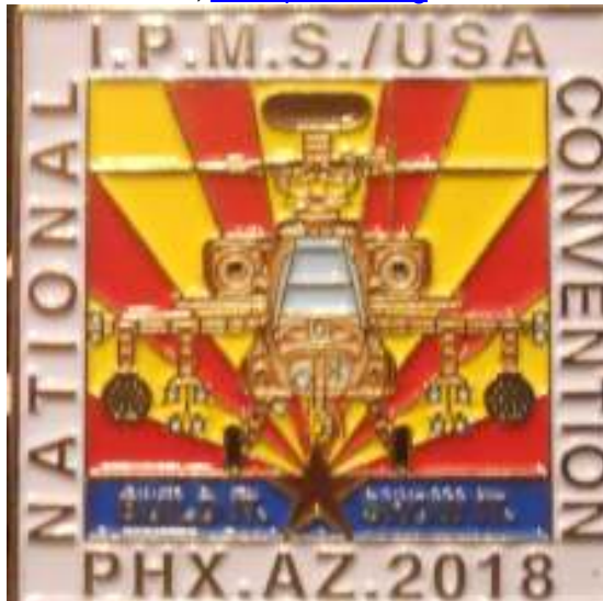
2018 Convention Lapel Pin

GTR is a proud member of the IPMS organization. GTR is a local chapter, in Region 5, of IPMS/USA. We need five current IPMS/USA members to remain a chapter. The annual recharter process is coming up soon. So we encourage those who have lapsed to renew their IPMS/USA membership, or if you have never been a member enroll now! Details can be found at their web site, www.ipmsusa.org .