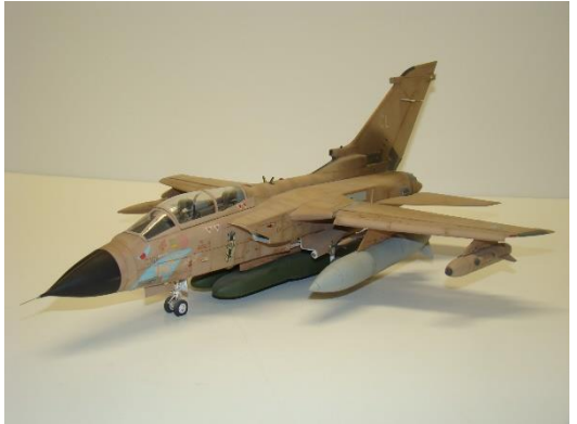
Panavia Tornado