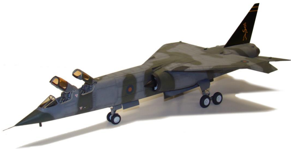
TSR.2