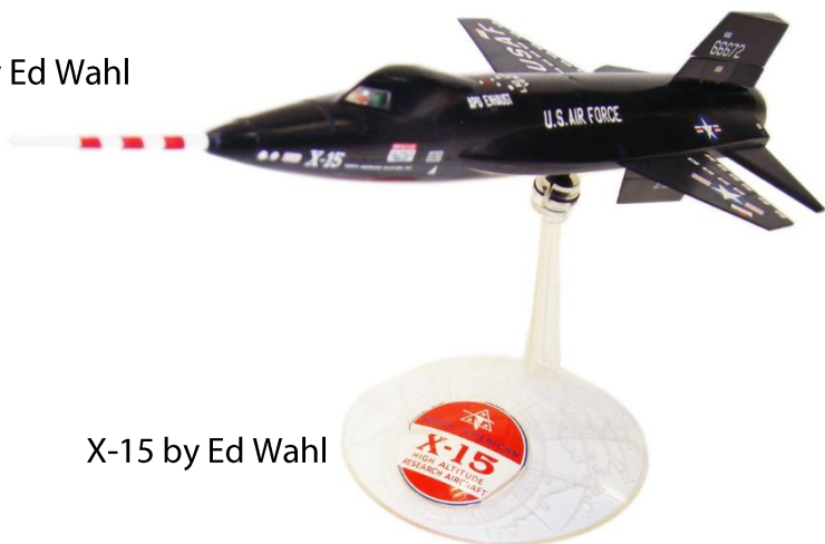
X-15 by Ed Wahl