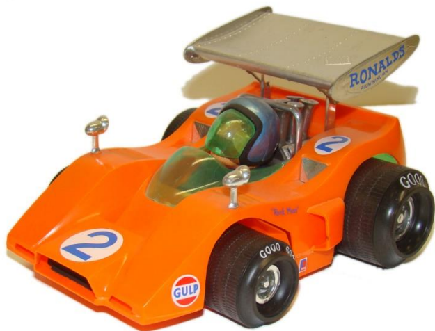
Deal's Wheels McLapper by Ed Wahl