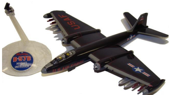
B-57 by Ed Wahl