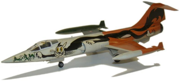
F-104