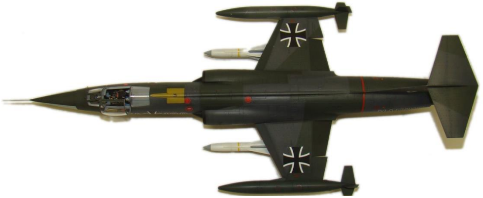
F-104 by Ed Mate