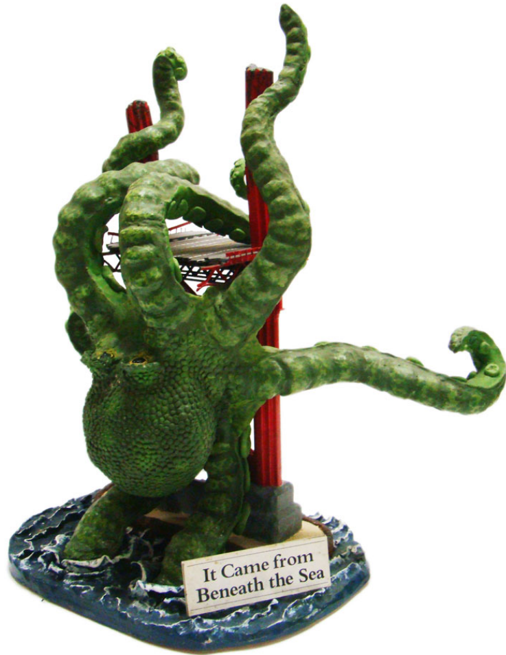
It came from beneath the sea