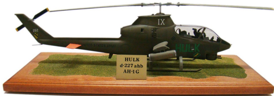
AH-1G