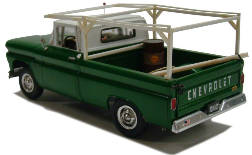
Chevy pickup by Dave Stukel