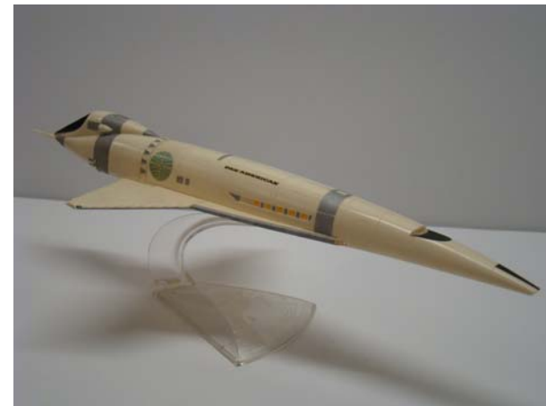
2001 A Space Odyssey Orion III