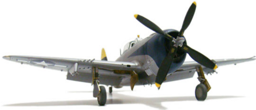
P-47D Bubble Canopy