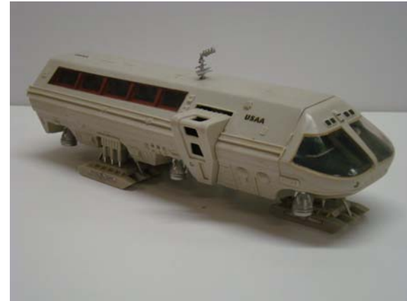
2001 A Space Odyssey Moonbus